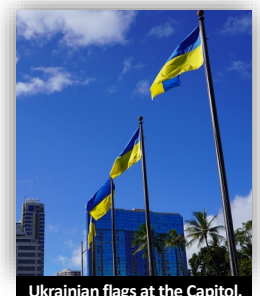
Ukrainian flags at the Capitol.