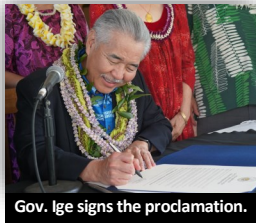
Gov. Ige signs the proclamation.

The guests and participants at the March 31 gathering reflected their own part in Hawai‘i’s history. They included former governors, representatives from the Royal Order and Hawaiian Civic Clubs, the Washington Place Foundation, cabinet members, legislators, and kūpuna from the DOE’s Office of Hawaiian Education. Hula students from three schools – Nu‘uanu Elementary, Keolu Elementary and Ke Kula Kaiapuni ‘o Ānuenue – performed “Lili‘u Ē” live at the event. In a 21 st century twist, they were joined by 2,300 fourth graders from 38 schools in a livestreamed statewide hula.