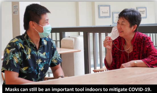
Masks can still be an important tool indoors to mitigate COVID-19.

The latest sign that Hawai'i is "learning to live with COVID" came when Governor Ige lifted the statewide indoor mask requirement at 11:59 p.m. March 25 when the emergency proclamation expired. But he and DOH officials are encouraging everyone to remain cautious since "we're not out of the woods yet." The governor said: "Together, we have reduced COVID-19 in Hawai'i to the point where most of us will be safe without masks indoors. Right now, hospitalizations are trending down. Case counts are falling. We are better at treating people who are infected. Boosters are saving lives. And the CDC has rated the state's COVID-19 community level as 'low.' However, the state will be ready to reinstitute the mask policy if COVID case numbers surge."