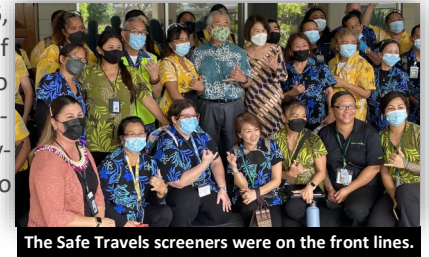
The Safe Travels screeners were on the front lines.

In case you missed it, there's good news in time for summer travel: As of March 26, passengers arriving in Hawai'i from domestic points of origin don't have to show proof of a COVID-19 vaccination or a pre-travel negative test result. Incoming passengers also aren't required to create a Safe Travels account or provide traveler information. International passengers will continue to follow the requirements put in place by the federal government. In addition, state and county employees and visitors to state facilities are no longer required to provide vaccination status or negative COVID test results.