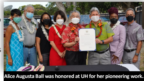
Alice Augusta Ball was honored at UH for her pioneering work.

The past month also provided more opportunities to honor women who have served to inspire others. Whether it’s a queen at Washington Place, a pioneering scientist in Mānoa or a teacher in Kalihi, women have remained strong role models from the past and for the future. Alice Augusta Ball , who made her mark more than 100 years ago, was honored at UH Mānoa in a special ceremony Feb. 28. Ball was UH’s first African-American graduate and the first woman to earn her master’s degree in chemistry in 1915. She was a pioneering scientist who at age 23 discovered a treatment for Hansen’s disease (leprosy) using oil from the Chaulmoogra tree.