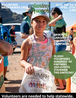
Volunteers are needed to help statewide.