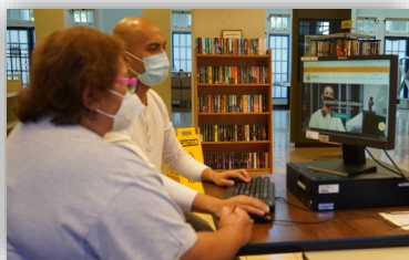
Public libraries can expand as digital hubs.

A. It's a terrible breach of public trust. I do believe elected officials must operate at the highest level of ethics. That's why when I was a legislator I did not have fundraisers during session. It's bad practice to have fundraisers to solicit campaign contributions at the same time they're holding hearings on measures and making decisions that impact these contributors.