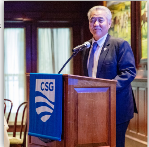
Governor Ige is serving as the 2022 national president of the Council of State Governments, the largest organization of state officials. He welcomed members in Washington, D.C.

A. With the pandemic, virtually every service the state provides — from education to unemployment and SNAP benefits to library services — went online because we had to. We want to make government investments using federal and state funds in what we call the "middle mile" to deliver affordable broadband to every single resident in the state, whether they live in a rural community or an urban area. And we want to have our libraries help deliver the "last mile" of services as community hubs where people can go for help.