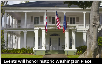
Events will honor historic Washington Place.