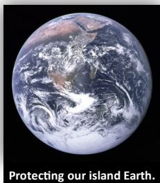
Protecting our island Earth.

The governor also joined several other U.S. Climate Alliance governors for a discussion of how the states and the Biden administration can expand economic opportunity through collaborative climate action. "Addressing climate issues can and should play a significant part in our pandemic recovery," said Governor Ige. "Making the transition to renewable, indigenous resources for power generation allows us to keep at home at least $4 billion currently spent out of state for oil. We save on electricity bills and generate jobs—in turn improving our economy, environment and energy security." He added, "As an electrical engineer and businessman, I understood (back in 2015) the future is 100 percent renewable. And even though we don't know exactly what that future will look like, we do know that putting out that North Star, making that commitment was important to drive how we transform Hawai'i's economy."