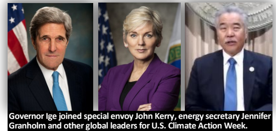
Governor Ige joined special envoy John Kerry, energy secretary Jennifer Granholm and other global leaders for U.S. Climate Action Week.

In a series of high-profile U.S. Climate Action Week events viewed around the world last month, Governor Ige highlighted Hawai'i's leading role in addressing global warming and transition to renewable energy. The sessions focused on the United States' renewed commitment under the Biden administration to take "bold action" on climate change and join with other nations to reduce greenhouse gas emissions. The governor emphasized, "Hawai'i was the first U.S. state to commit to 100 percent renewable power by 2045 —and we're excited the Biden administration is looking to raise that ambition for the entire country."