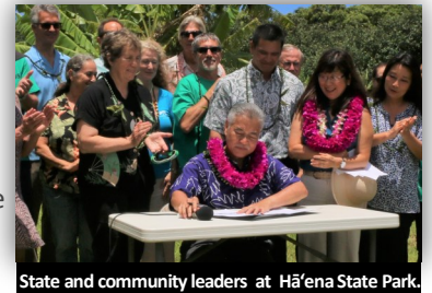
State and community leaders at Hā'ena State Park.

A. We're embarking on a new Hawai'i 2.0 course for the visitor industry. We want visitors who respect our norms, our environment and our Hawaiian culture. The Hawai'i Tourism Authority (HTA) and the rest of us in state leadership recognize the need to manage the number of visitors — especially for "hotspots" in our communities, as we've done at Hā'ena State Park on Kaua'i . We also need to do a better job of clamping down on illegal vacation rentals in residential neighborhoods and investing more tourism dollars in natural and cultural resources. HTA is taking a comprehensive approach to destination management based on the "four pillars" of its strategic plan: natural resources, Hawaiian culture, community engagement and responsible travel.