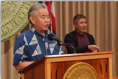
Gov. Ige announces the vaccine exception program.

I n this pandemic, every milestone counts. For Hawai'i, the good news is that we've opened vaccinations to anyone age 16 and up, we're making it easier for fully vaccinated residents to travel intercounty if they received their shots in Hawai'i and we're laying the groundwork in communities statewide for more mindful tourism as summer approaches. The state also took center stage for Earth Week as a global leader in fighting climate change — a top priority of the Ige and Biden administrations.