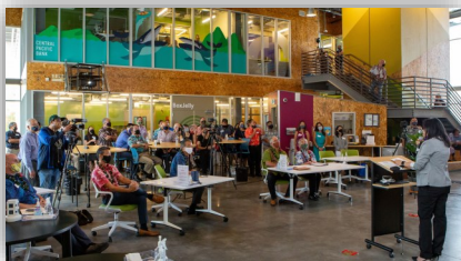
The Entrepreneurs Sandbox is an innovation hub.

From startup to product launch - The Hawaii Technology Development Corporation (HTDC) secured federal grants totaling over $1 million to help local businesses survive the pandemic through digital marketing. HTDC's e-commerce program provided more than 200 companies and entrepreneurs with training and hosted more than 50 virtual events. In 2022, the agency is scheduled to launch a $56 million State Small Business Credit Initiative to provide access to capital for small businesses. HTDC's INNOVATE Hawai'i increased local manufacturing capacity for producing cleaning supplies and PPE. Free consultations are available every month for companies interested in growing their businesses. After a two-year hiatus, HTDC will also hold its next Virtual Tech Job Fair Jan. 21 for both job-seekers and companies looking for talent. The Entrepreneurs Sandbox , an innovation hub, offers free online classes for Hawai'i residents, digital workshops with private sector partner TRUE, and launched ID8 studios as a production site for ad agencies, fashion designers, musicians and film companies.