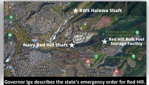
Governor Ige describes the state's emergency order for Red Hill.

Q. What are the next steps, based on the issues raised during the contested case hearing on the emergency order?