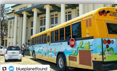
New laws promote electric vehicles statewide.

where anyone can take a virtual tour of the state's spectacular nature preserves and donate to help preserve them. Also, the Hawai'i State Energy Office has been awarded a two-year FEMA grant to support the state's critical infrastructure and energy lifelines.