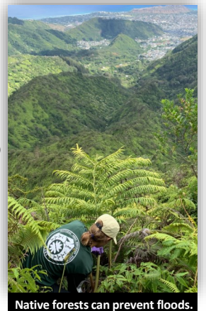
Native forests can prevent floods.

All these actions support the governor's Sustainable Hawai'i Initiative, the Hawai'i 2050 Sustainability Plan and the state's climate goals and clean energy commitments. "Our vision includes a diversified economy rebuilt sustainably, not a simple return to business as usual post-pandemic," said Governor Ige. At COP26, the UN climate summit in Scotland, Hawai'i was recognized for its climate change leadership. "We showed how a small island state like Hawai'i can move the world with innovation, big ambition and action," said the governor.