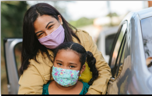
Families hit by the pandemic survived, thanks to many programs.

DHS extends lifelines for individuals and families - For those hardest hit by the pandemic, the state Department of Human Services (DHS) met the major surge in demand to ensure people had access to food, healthcare and childcare. This included a 32% increase in Medicaid enrollees since March 2020. The program now provides coverage for more than 430,000 residents, which is nearly 30% of the state's population. An additional 32,000 Supplemental Nutrition Assistance Program (SNAP) households were added since the onset of the pandemic with $240 million in funds distributed to ensure the children of Hawai'i had enough to eat. DHS will administer nearly $80 million in American Rescue Plan Act grants to strengthen the childcare system. As the only state department providing these safety net programs, DHS continues to be vital. Also, the