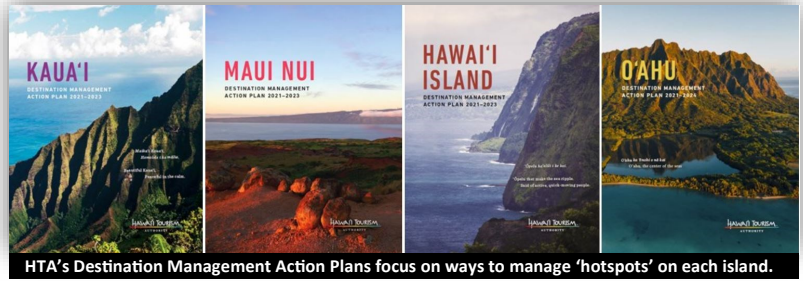
HTA's Destination Management Action Plans focus on ways to manage 'hotspots' on each island.

R eimagining tourism for local communities and visitors - In the face of new COVID-19 variants like Omicron, Hawai'i's Safe Travels program remains more important than ever. Since the pre-travel testing program launched in October 2020, more than 8.3 million travelers have used the platform. It's part of a multilayered strategy to protect the health of residents and visitors alike. As more local restaurants and other venues began checking customers' vaccination status, the state also launched a new SMART Health Card to make it easier to present proof of vaccination. The Hawai'i Tourism Authority is focusing on "regenerative tourism" to improve the visitor experience while supporting the quality of life for residents. HTA's 2021 – 2023 Destination Management Action Plans identify "hotspots" on each island and ways to manage visitor numbers to protect natural and cultural resources. "We need to educate our visitors and make them part of the solution," said HTA CEO John DeFries.