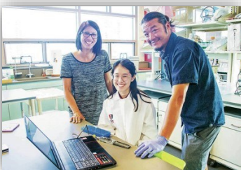
'Iolani School will be working with 17 other schools statewide to prepare more Hawai'i students for careers in biotechnology.

Also, the Hawai'i State Public Library System retooled its services and enabled patrons to access more ebooks, movies, virtual storytimes and educational resources for students learning remotely. It also added new kinds of collections and expects all public libraries will have 'ukuleles to lend to their community in 2022. The libraries are also working with their partners to advance digital equity and literacy and will lead the NGA Workforce Innovation Network grant to support digital skill development for a 21 st century workforce .