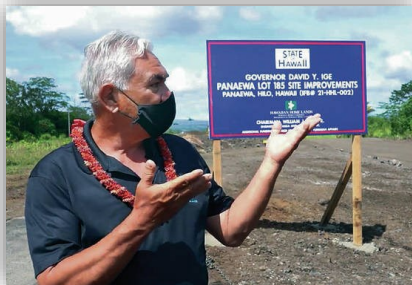
DHHL's program of subsistence ag, small farmland homesteads, broke ground outside Hilo last September.

DHHL partnered with the Council for Native Hawaiian Advancement to include all eligible Native Hawaiians in Hawai'i in a $5 million Rental and Utilities Assistance program. As a result, the U.S Treasury released additional emergency rental assistance funds to "high-performing" state and local government grantees, of which DHHL was one. DHHL has continued to deliver infrastructure and capital improvement projects for beneficiaries throughout the pandemic, including a $27 million project to upgrade the 80-year-old Ho'olehua Water System to improve the limited water supply for Moloka'i beneficiaries.