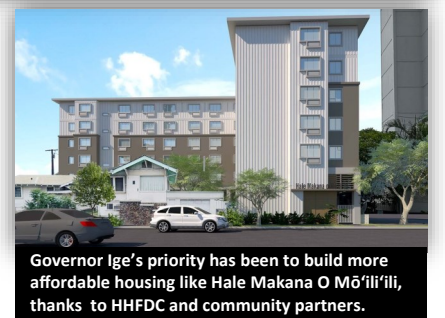
Governor Ige's priority has been to build more affordable housing like Hale Makana O Mō'ili'ili, thanks to HHFDC and community partners.

Keeping DHHL beneficiaries in their homes and more – Since the state confirmed its first COVID-19 case in March 2020, the Hawaiian Homes Commission has taken action to postpone mortgage payments; provide rent, utility relief and grants; and approve a pilot loan program for downpayment assistance for fee-simple residences not on Hawaiian Home Lands on O'ahu.