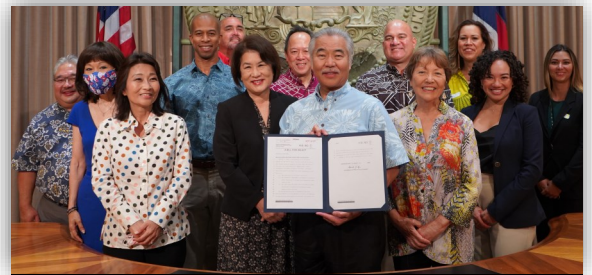
Legislators and advocates joined the governor and Mrs. Ige for the bill signings.

G overnor Ige called it "the largest state investment in pre-kindergarten education in Hawai'i's history . . . our first big opportunity to make progress in this area." The legislation — HB 2000, now Act 257— provided $200 million for pre-K construction and helps deliver on a vision the governor described in his 2019 State of the State address. He called for "a universal, statewide public preschool system to give every child in the state a head start on learning." This and other bills signed into law that day added to the Ige administration's track record of advancing education at all levels. In addition to HB 2000, the other bills included: