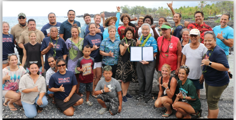
Miloli'i community members celebrate the governor's signing of rules to protect its ocean resources.

T o be more pono for future generations." That vision is what drove a dedicated group of community members to work with the state's Department of Land and Natural Resources (DLNR) and other organizations to develop administrative rules to protect ocean resources along 18 miles of coastal waters on Hawai'i island. "Community involvement has been critical to bringing us here today," said Governor Ige. "By blending traditional and modern knowledge through a community-led effort, we have set an amazing example of how we can work together to ensure our public trust resources are protected and preserved. Miloli'i will be an ocean classroom to teach the next generation about traditional fishing practices and the value of conservation."