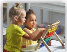
More pre-K options are planned.