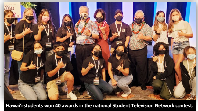
Hawai'i students won 40 awards in the national Student Television Network contest.

A. Hawaiian Electric is forecasting an increase of about 7% or $15 for a typical residential customer's bill on O'ahu, but the rise will be temporary. The higher cost is tied to global oil prices being driven up after Russia invaded Ukraine, although more oil has been made available from U.S. reserves. In Hawai'i, the Clearway solar project and others coming online are important because, overall, we'll be reducing electricity bills for the future and fighting climate change, especially with green energy support through President Biden's new Inflation Reduction Act .