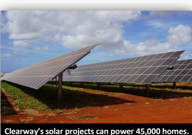
Clearway's solar projects can power 45,000 homes.

A. COVID-19 remains a challenge, so we need to understand how best to manage the virus on a lot of fronts. There's new technology we've deployed to purify and clean air within classrooms. And we need to continue to focus on actions we can take as a community to reduce the spread of the virus. For instance, I know it's not easy for parents to keep children home from school if they have just mild symptoms, but that one small act can save others from getting infected.