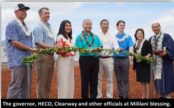
The governor, HECO, Clearway and other officials at Mililani blessing.

G overnor Ige, state officials and community stakeholders celebrated the launch of O'ahu's first utility-scale solar and battery project from Clearway Energy Group. The 39-megawatt solar project comes online at a time the state is shutting down its last coal plant and will help advance the state's goal of 100% clean, renewable energy for electricity by 2045. "This project will replace some of that coal energy and will reduce our dependence on oil during the transition," the governor said.