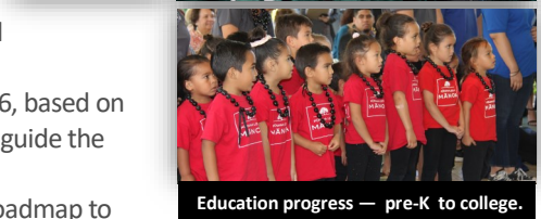
Education progress — pre-K to college.