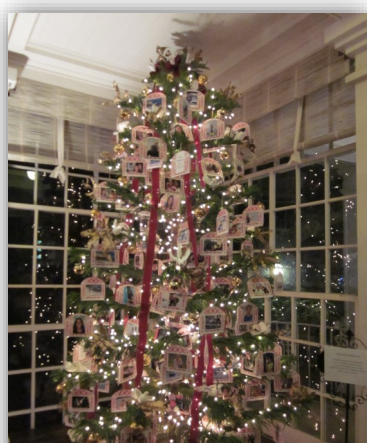
Beautifully decorated Norfolk Pine Christmas tree at Washington Place.

Free parking will be available at the State Department of Health parking lot by entering off Miller Street.