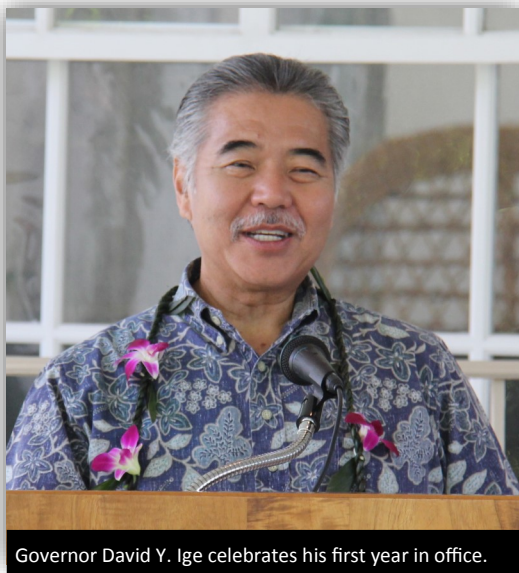
Governor David Y. Ige celebrates his first year in office.

Capitol Connection with Gov. David Ige is a regular e-newsletter that provides you with updates from the fifth floor of the State Capitol. As the Governor's Office works to become paperless, the newsletter will be available on-line and via subscription. Check out the Governor's website at governor.hawaii.gov to subscribe to this newsletter. Also, follow Governor on Twitter and Instagram @govhawaii and check the Facebook postings at www.facebook.com/GovernorIge for daily activities.