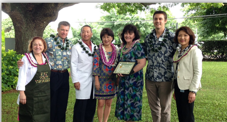
First Lady Dawn Ige presented a certificate of recognition during the Food Day Celebration at Castle Medical Center to promote healthy eating.

The Department of Commerce and Consumer Affairs the Department of Health and the Attorney General's office partnered to publish the updated guide.