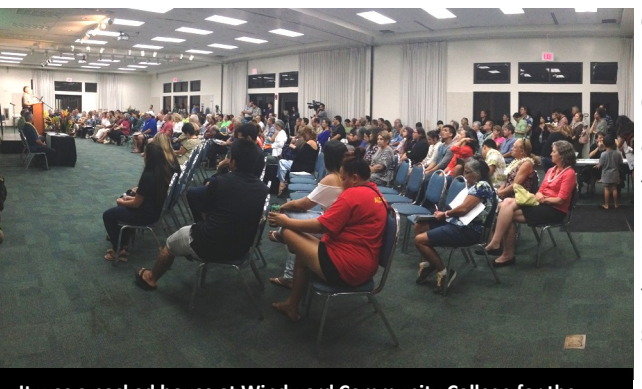
It was a packed house at Windward Community College for the governor's first "Community Connection."

Governor Ige and members of his cabinet held the first in a series of community forums called "Community Connection" at Windward Community College on Oct. 26, 2015. The event drew a large, appreciative crowd that asked a wide range of questions on topics that included TMT, education, traffic and homelessness.