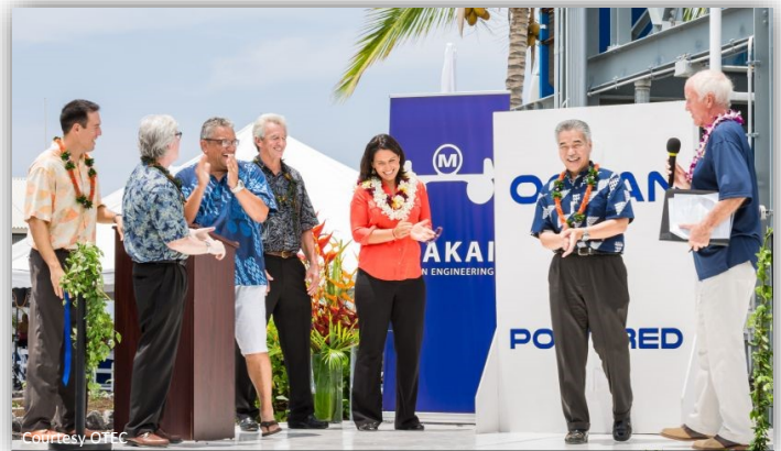
Gov. Ige joins Congresswoman Tulsi Gabbard and county officials in "flipping the switch" at the Ocean Thermal Energy Conversion plant blessing in Kona.