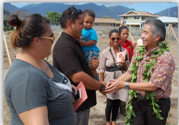
Under the Self-Help Housing Program, low-income families can help each other build their own homes, making these fee simple houses very affordable ($256,000 - $276,000).

The Hawaii Health Connector — We remain committed to helping people move from the private Connector site, which has struggled since its launch in 2013, to enrollment in the federal exchange at healthcare.gov . We also want to preserve the Prepaid Health Care Act that has kept our uninsured rate among the lowest in the nation.