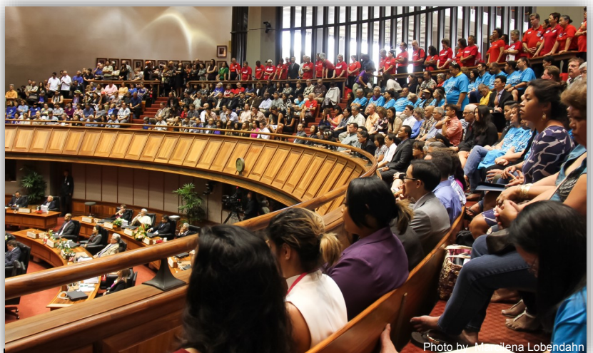
A packed gallery listens to the governor's State of the State address at the Legislature Jan. 25.

Contact Us: Executive Chambers, State Capitol Honolulu, Hawaii 96813 Phone: (808) 586-0034 Fax: (808) 586-0006