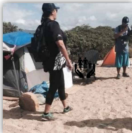
Kalihi-Palama Health Center outreach workers visit some of the homeless individuals in Ewa Beach Park.