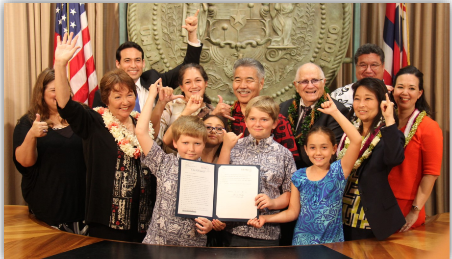
Gov. Ige and legislators, along with Kaelepulu School students and parents, celebrate the “cool schools” bill signing.

• Cooling the schools – This was my top priority, and I’m so proud that we put our students first. We’re thankful the Legislature found the right funding source for the $100 million to provide air conditioning, heat abatement and related energy efficiency measures for the schools.