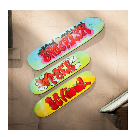
Students at Brooklyn Free School direct their own learning. There are no grades or formal assignments.