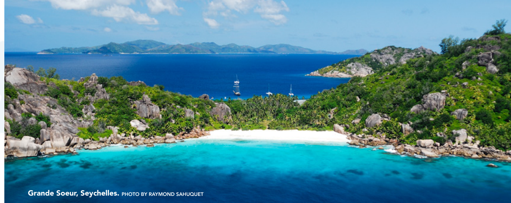
Grande Soeur, Seychelles.

Recognizing that existing public resources alone are insufficient to achieve island goals, the Partnership is focused on incubating new partnerships to create innovative models that can mobilize large-scale investment in sustainable development initiatives such as the Island Resilience Challenge. This Initiative engages the island and global community to build a pipeline of sustainable development projects around resilient, integrated infrastructure at the water-energy-food nexus on an initial ten islands.