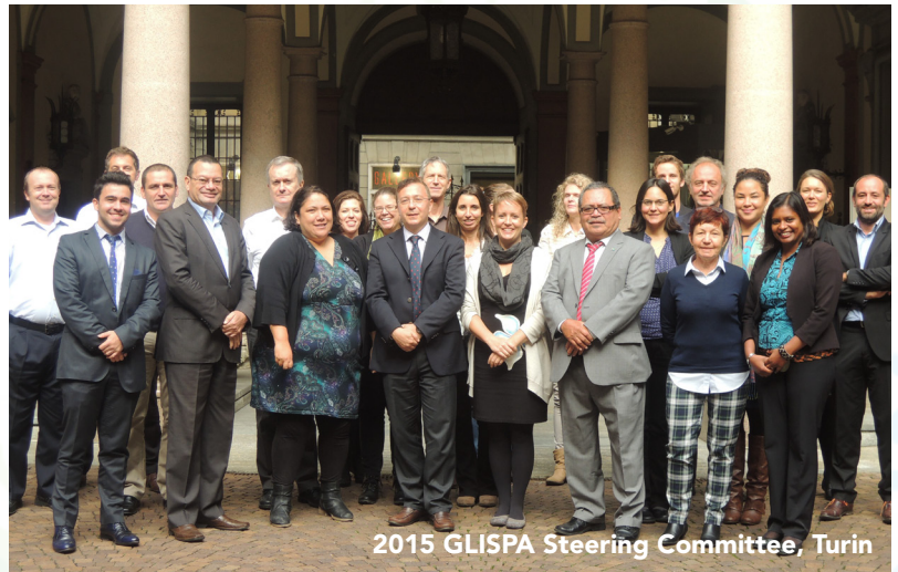
2015 GLISPA Steering Committee, Turin

Get involved with the Global Island Partnership.