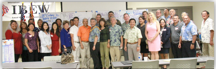
The governor with the Kalihi 21st Century Vision Team he initiated to gather ideas for improving the community.

That's what Gov. Ige and the state Office of Planning is asking residents to do as part of his Kalihi 21 st Century initiative. The committee that includes legislators, community leaders, and non-profit representatives is holding a series of public meetings to imagine a new Kalihi — with rail and without the 100-year-old jail, the O'ahu Community Correctional Center (OCCC).