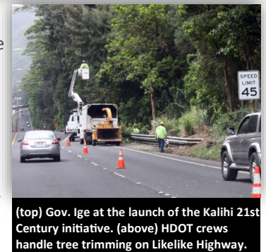
(top) Gov. Ige at the launch of the Kalihi 21 st Century initiative. (above) HDOT crews handle tree trimming on Likelike Highway.