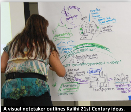
A visual notetaker outlines Kalihi 21st Century ideas.

The jail sits on 16 acres of state-owned land in Kalihi, between two proposed rail stations. Often, he said, the community doesn't have a chance to weigh in at the beginning of what is usually a complex planning process. "The governor wanted to get more community members involved, thinking about the possibilities at the outset — to hear what they'd like to see and to talk to each other, to make connections within their own Kalihi community," he said.