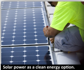
Solar power as a clean energy option.

I n addition to HI Growth, the state has undertaken other initiatives that utilize innovation to grow the bottom line. Our goal of generating 100 percent of our electricity from renewable sources by 2045 is good for both our economy and the environment. We lead the nation in moving toward clean energy in many areas.