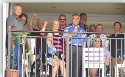
Kaua'i seniors with the governor for the second phase of Kaniko'o, an affordable 90-unit housing project.

We worked to infuse the state's Dwelling Unit Revolving Fund with $25 million to finance regional infrastructure with the counties and private home builders. And thanks to the Legislature's support, we've also added $75 million in gap financing for more affordable rentals throughout the state. My budget for the next two years proposes to invest $123.4 million to promote new housing starts.