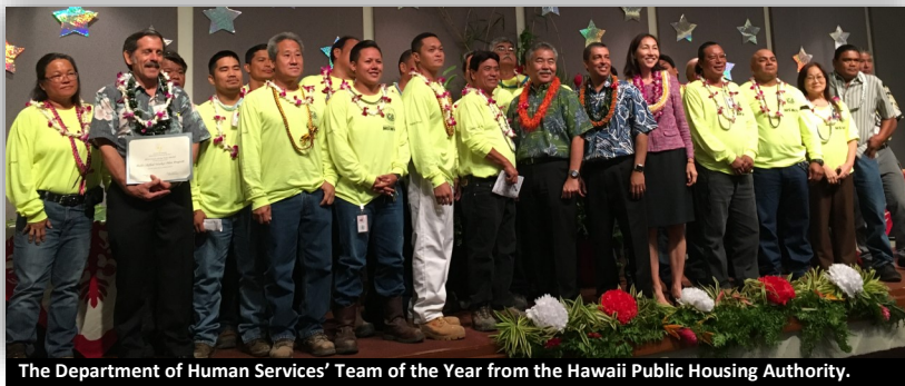
The Department of Human Services' Team of the Year from the Hawaii Public Housing Authority.