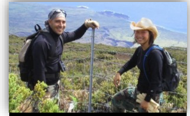
Working together to protect state watersheds.