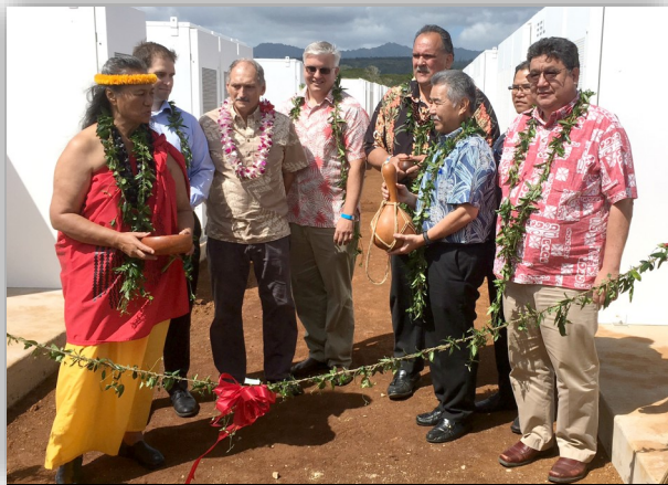
Gov. Ige, Mayor Bernard Carvalho and Senate President Ron Kouichi gather with Tesla and KIUC officials at the blessing of a new Kaua'i solar farm.

A Kaua'i solar farm project that uses Tesla batteries to store enough power to serve 4,500 homes during peak night hours is helping the state reach its goal of having 100 percent of its electricity come from renewable energy sources by 2045.