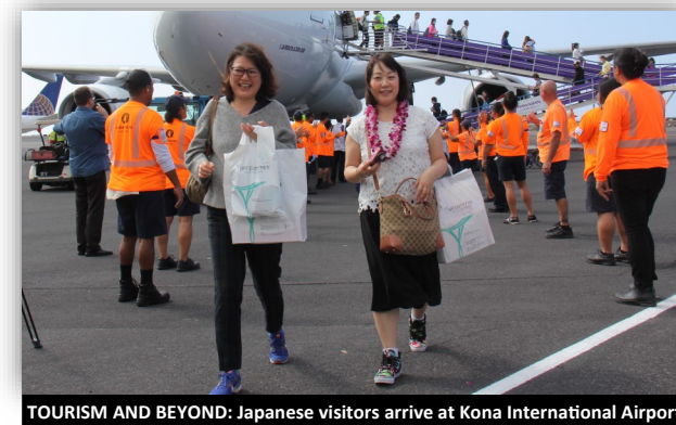
TOURISM AND BEYOND: Japanese visitors arrive at Kona International Airport.