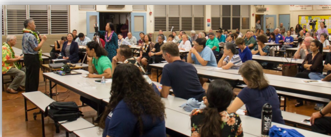
LISTENING SESSION: Gov. Ige answered a wide range of questions at a May 3 town hall. (right) Pearl City Highlands students and supporters celebrate the school's teams who represented the state at the World Lego Festival for robotics in Houston.