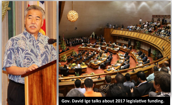
Gov. David Ige talks about 2017 legislative funding.

A. It’s easy to focus on the differences, but we also saw a lot of agreement on important issues such as education, affordable housing and homelessness, and sustainability. This session was unusually challenging because after we submitted our executive budget, the revenue projection ended up being $800 million less. We also entered into negotiations with the unions for 14 new contracts and have settled most of them. I got personally involved in the teachers’ union negotiations because it was a priority for me to see a settlement before the June 30 deadline. Having that uncertainty wasn’t good for our schools, teachers or students.