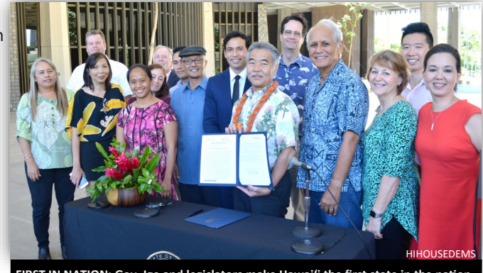
FIRST IN NATION: Gov. Ige and legislators make Hawai'i the first state in the nation to enact laws that align with the Paris climate agreement.