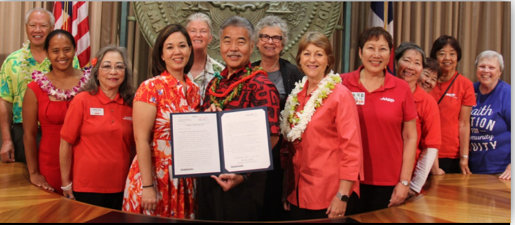
Gov. Ige stands with legislators and senior advocates after signing the Kupuna Caregivers bill.

Through a $600,000 appropriation, the Executive Office on Aging (EOA) will administer the program to begin in 2018. For details, contact your county Aging and Disability Resource Center through the statewide number, 643-2372.