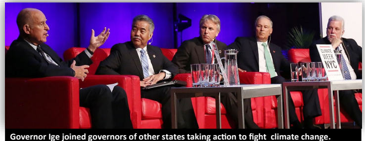
Governor Ige joined governors of other states taking action to fight climate change.

The alliance's 2017 report included good news for both the environment and the states' economies: