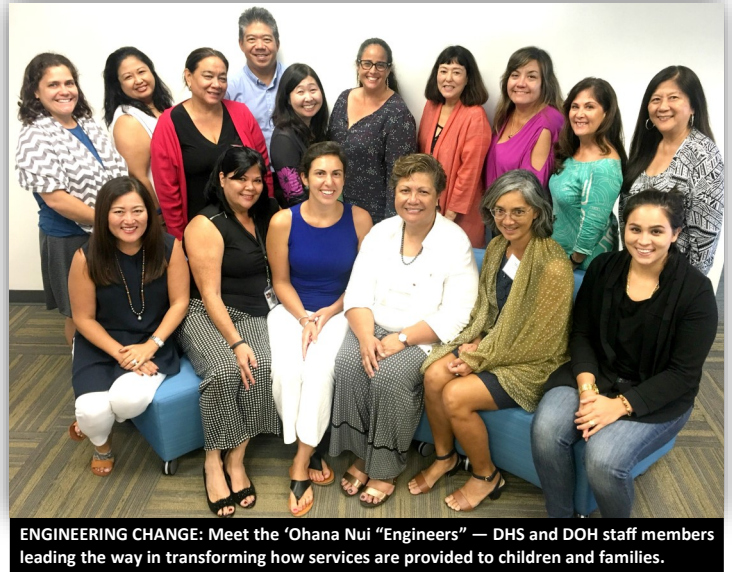
ENGINEERING CHANGE: Meet the 'Ohana Nui "Engineers" — DHS and DOH staff members leading the way in transforming how services are provided to children and families.