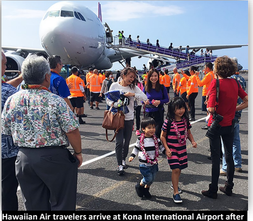
Hawaiian Air travelers arrive at Kona International Airport after re-opening of Federal Inspection Service for international flights