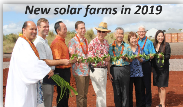
ENERGY PROGRESS: Gov. Ige and community partners at NRG ceremony.

Maui - Thursday, May 31, 9:30 - 11:30 am, Wailuku State Office Building, 3 rd floor conference room A,B,C; and May 31, 5 - 7 pm, Maui Waena Intermediate School cafeteria, Kahului.