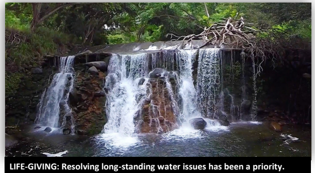
LIFE-GIVING: Resolving long-standing water issues has been a priority.