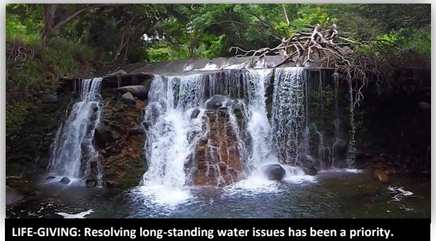
LIFE-GIVING: Resolving long-standing water issues has been a priority.