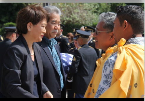
(top) The Hawai'i National Guard stood watch as the late Sen. Akaka lay in state in the Capitol rotunda. Governor Ige and the first lady greet Danny Akaka, Jr. and family members.