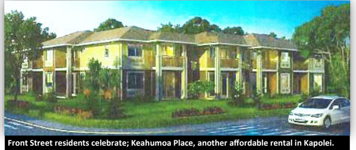
Front Street residents celebrate; Keahumoa Place, another affordable rental in Kapolei.

Three more O'ahu projects also got under way last month with state-assisted financing. They include Waipahu Tower , an affordable rental housing project for families earning 60 percent and below the area median income (AMI). The eight-story building is an acquisition/rehabilitation project set to remain affordable for 59 years. A second project is Nohona Hale in Kaka'ako , being built on state HCDA land near the HART rail station. The 111 micro-units also received state financing assistance and are targeting families earning 30 to 60 percent AMI. The third project is Keahumoa Place , a 320-unit planned community near the Kapolei Rail Station . Phase I will consist of 75 units and will provide affordable family rentals at 60 percent AMI for 65 years. Estimated completion for Phase I is 2019-2020.