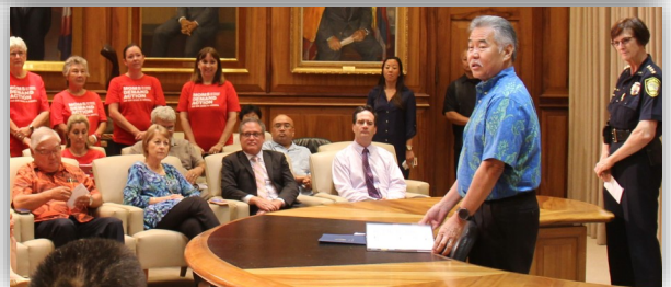
The Women's Legislative Caucus holds copies of their signed bills (top). HPD Chief Susan Ballard and advocates join Gov. Ige and legislators for the signing of the bill banning bump stocks and other multi-burst devices.