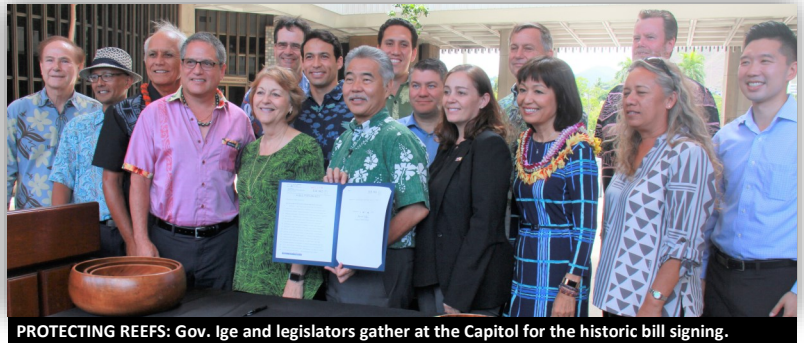
PROTECTING REEFS: Gov. Ige and legislators gather at the Capitol for the historic bill signing.

With the stroke of a pen, Governor Ige made Hawai'i the first place in the world to ban the sale of sunscreens with the chemicals oxybenzone and octinoxate, effective Jan. 1, 2021. At the signing ceremony, the governor said, "Our natural environment is fragile, and our own interaction with the Earth can have lasting impacts. This new law is just one step toward protecting the health and resiliency of Hawai'i's reefs."