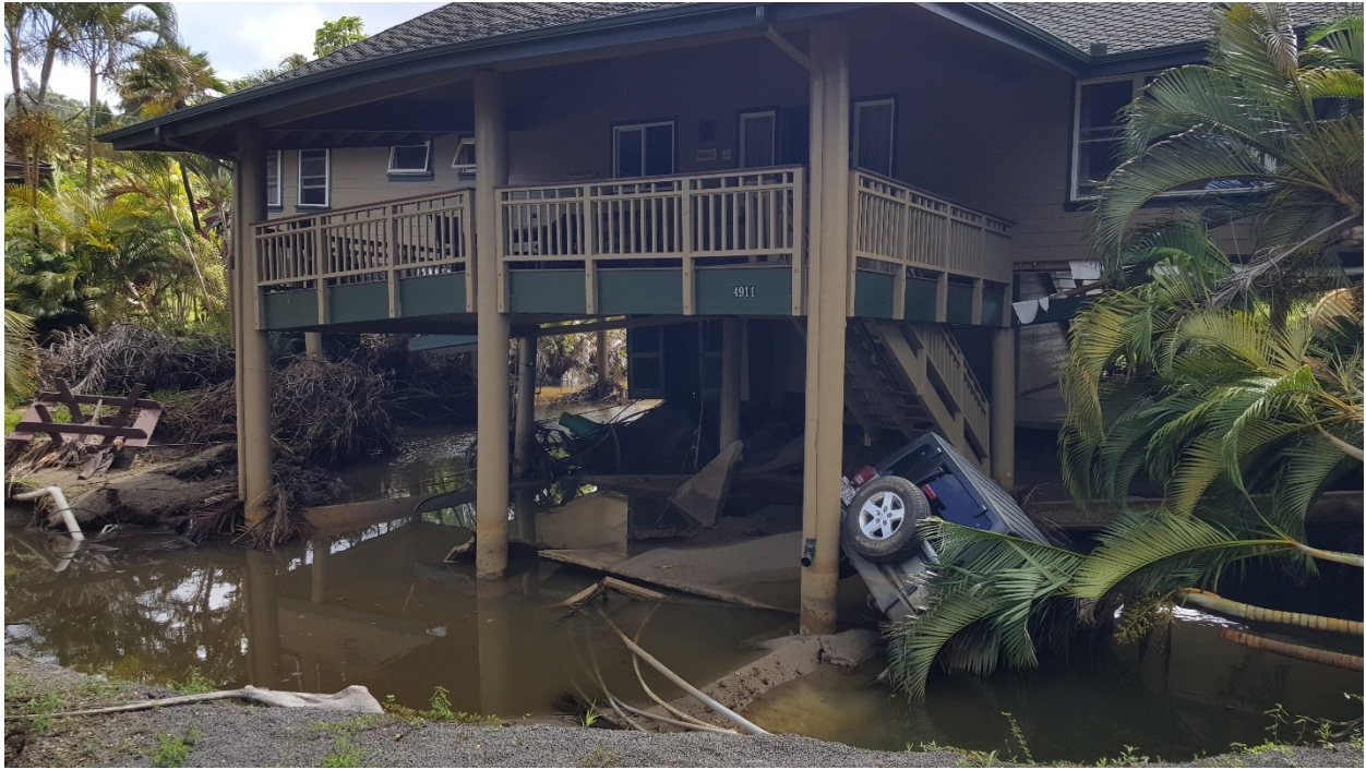
Above: A damaged home and vehicle on Weke Road, Hanalei, Kaua'i.