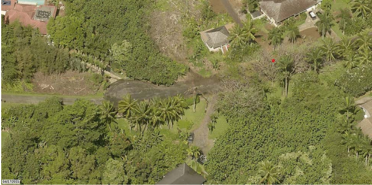
Above: Aerial photograph of Puu Road in Haiku taken before Hurricane Lane.