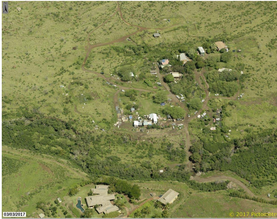
Above: Kauaula Valley as seen March 2017. Below: Kauaula Valley following Maui wildfires during Hurricane Lane August 2018.