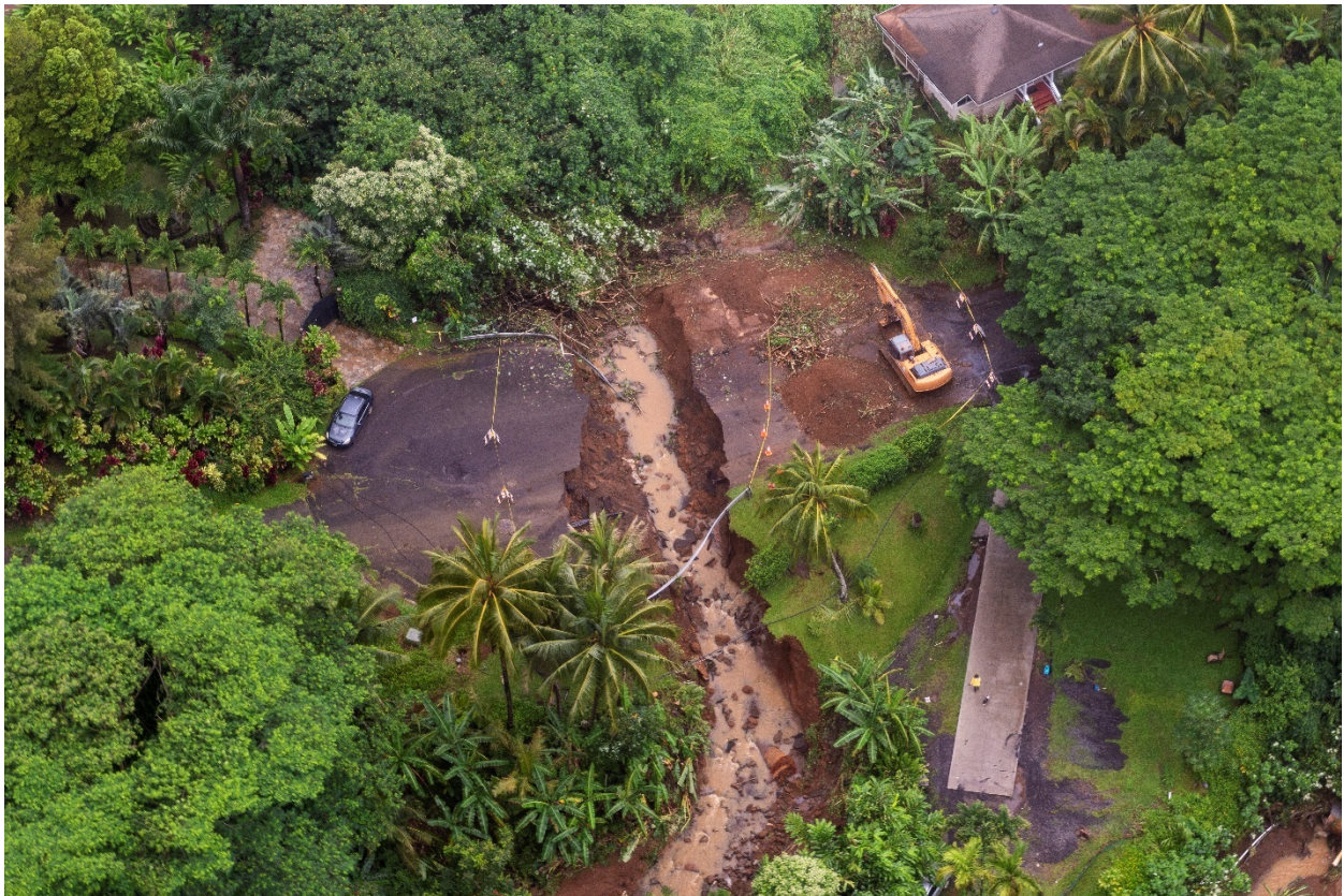
Below: Aerial photograph taken following Hurricane Lane shows a large washout of Puu Road, isolating three residences.