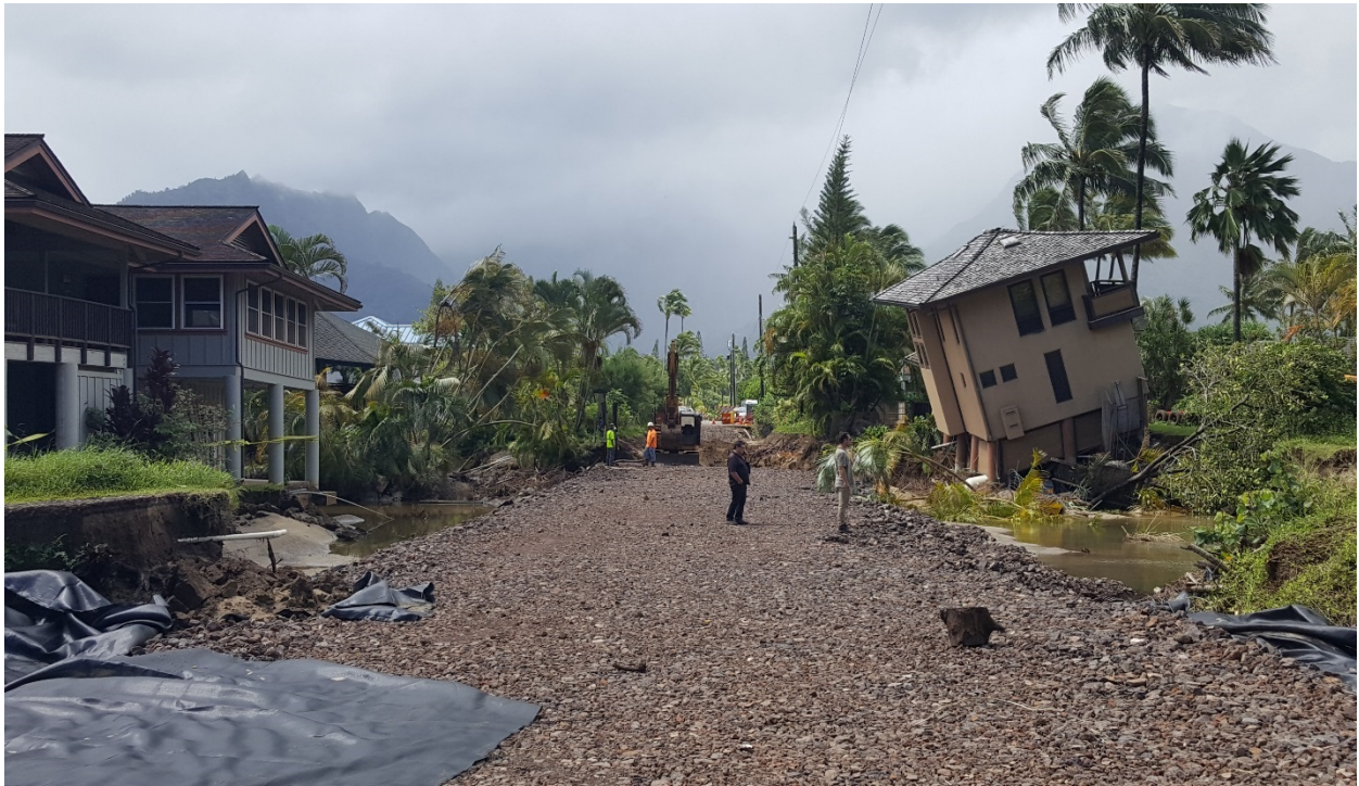
Above and Below: Weke Road washout and damaged homes on Weke Road, Hanalei, Kaua'i.