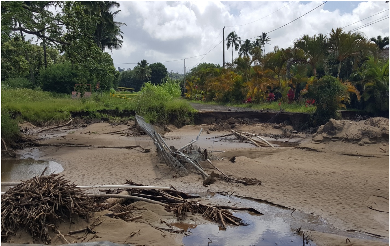
Below: Damage to Weke Road and infrastructure in Hanalei, Kaua'i.