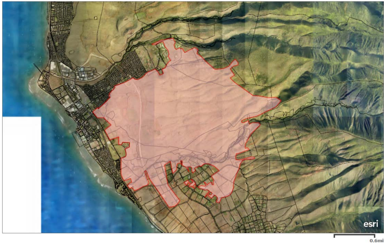
Above: Perimeter map of the Lahaina Fire in Maui. Below: Map depicting damaged homes from the fire.