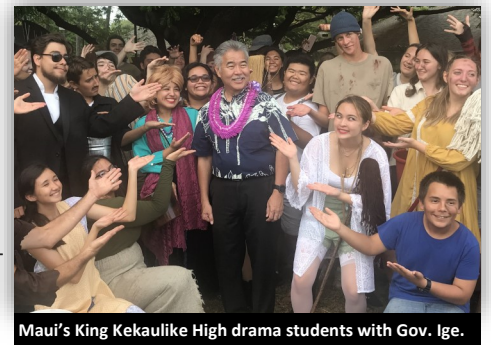
Maui's King Kekaulike High drama students with Gov. Ige.