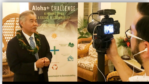
Hawai‘i has made progress on Aloha+ Challenge sustainability.

H awai‘i is once again ranked the healthiest state in the nation. Our unemployment rate is among the lowest in the country. Our visitor industry is moving toward another record-setting year, and both individual personal income and the state’s gross domestic product have been steadily growing. For four years, we have worked hard to put the state on sound financial footing by building our reserves and by paying down our unfunded liabilities, including those to our employee pension and health benefit systems. We now have the highest bond rating in the state’s history, resulting in lower interest rates when we need to borrow money. The state of the State of Hawai‘i is sound.