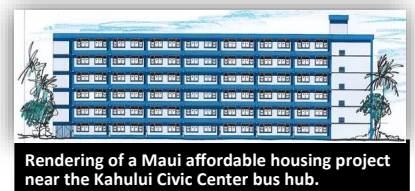
Rendering of a Maui affordable housing project near the Kahului Civic Center bus hub.