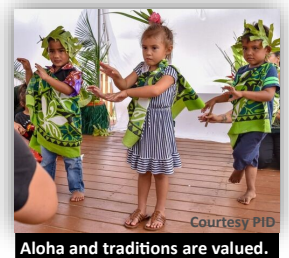
Aloha and traditions are valued.