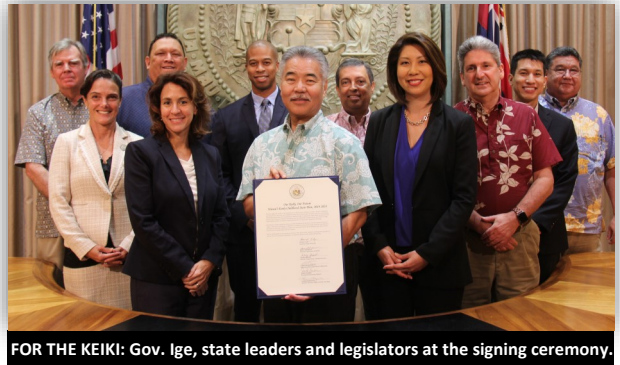
FOR THE KEIKI: Gov. Ige, state leaders and legislators at the signing ceremony.

A. Yes, it’s about maintaining the momentum from the successes we’ve had in our first term and recommitting to these priorities for the future. One initiative that could make the greatest difference involves our first-ever Early Childhood State Plan , which sets the foundation for statewide efforts in health, family services and education. As a state, we’re implementing our coordinated ‘Ohana Nui approach to break the cycle of poverty and provide families with the support they need. A vital piece of this involves universal, statewide access to public and private preschools.