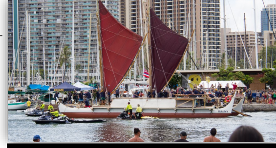
The Hōkūle'a came to symbolize a new era of wayfinding and discovery.

And while we are on the subject of Native Hawaiian culture, I want to speak on the Thirty Meter Telescope and Mauna Kea . Emotions have run high on both sides. The arguments are strong on both sides, and that's what makes