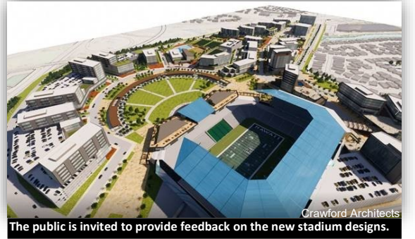
The public is invited to provide feedback on the new stadium designs.

W hen it's completed, the New Aloha Stadium Entertainment District (NASED) is envisioned as a vibrant mix of housing, restaurants, retail stores, hotels, recreation sites, cultural amenities, green space and, of course, a new stadium to replace the current aging facility. The state has allocated $350 million for the project and seeks to attract developers through a P-3 public-private partnership.