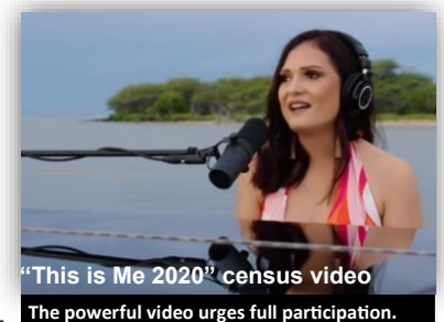
"This is Me 2020" census video The powerful video urges full participation.

To avoid census scams , know that the Census Bureau will never ask you for your social security number, donations, anything on behalf of a political party or your banking and credit card information. If you suspect fraud, call the Census Bureau at (808) 650-6611 to speak to a local Census Bureau representative. For details, go to census.hawaii.gov . If you want to apply to be a census worker, go to https://2020census.gov/en/jobs.html .