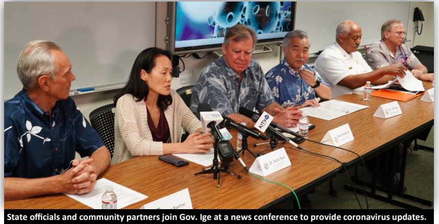
State officials and community partners join Gov. Ige at a news conference to provide coronavirus updates.

W ash your hands. Stay home if you're sick. Get your information from reliable sources, such as the state Department of Health (DOH) and the Centers for Disease Control (CDC). All that sounds pretty basic, but in the case of the novel coronavirus (COVID-19) , Hawai'i health officials say it's the best advice to reduce fear and prevent the spread of illness. They also recommend getting the seasonal flu shot to avoid confusion with the coronavirus, which has similar symptoms of fever, cough and shortness of breath.