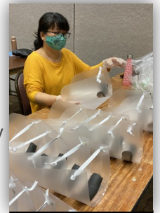
A volunteer assembles PPE.

H elping hands for PPE - For a second time in a month, volunteers from across O'ahu gathered at the Neal Blaisdell Center (NBC) to help assemble personal protective equipment (PPE) purchased by the state Department of Health for front-line healthcare workers. Over 150 volunteers answered the call, representing a wide range of community organizations. The volunteers worked in 11 rooms at the NBC, properly spaced apart so they could practice safe social distancing.