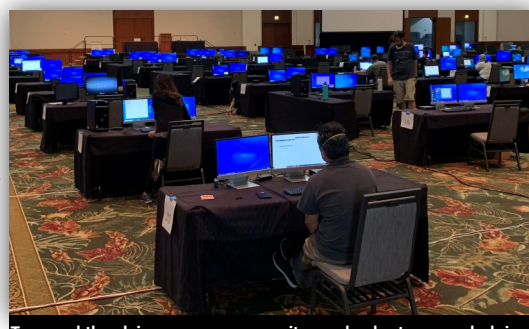
To speed the claims process, more sites and volunteers are helping.

T he Department of Labor and Industrial Relations (DLIR) is working as fast as it can, given its antiquated system, to handle the flood of unemployment claims. In February, DLIR received about 700 claims per week; recently in one day the department received some 25,000 filings. Claims are being processed faster, thanks to an increase in staff and volunteers from other state agencies and the Legislature. Director Murakami said individuals can check the status of their claims 24/7 at huiclaims2020.hawaii.gov/status . He also urged people to make sure their information is complete and accurate before they submit their forms since that would affect how quickly they receive payments. DLIR said between April 17-23 it distributed more than $68 million in unemployment insurance benefits, including "plus-ups."