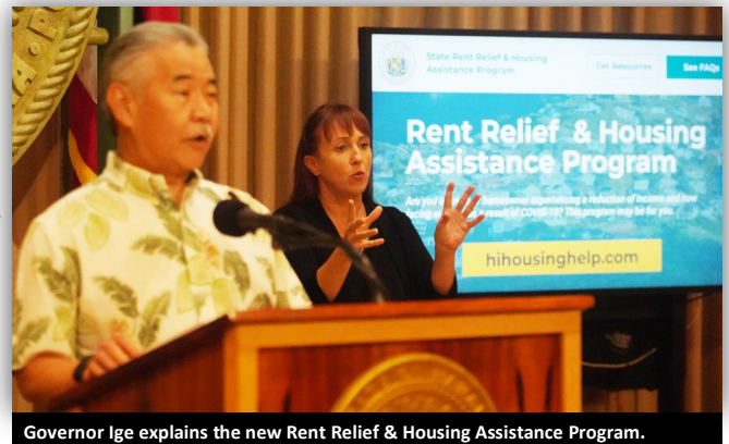
Governor Ige explains the new Rent Relief & Housing Assistance Program.

A. It's not a one-size-fits-all situation. A key metric is the number of positive COVID-19 cases per 10,000 population over a 14-day period by island as well as how well each school complex is able to mitigate the spread of the virus. This guidance from the Department of Health can help school leaders choose between online only, blended or face-to-face learning.