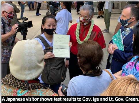
A Japanese visitor shows test results to Gov. Ige and Lt. Gov. Green.

The state has announced it is expanding its pre-travel testing agreements to Japan and Canada — Hawai‘i’s top two international markets — to allow visitors from those two countries to take part in the Safe Travels program. Like the one available to domestic travelers from the U.S. mainland, Japanese and Canadian visitors are able to bypass the state’s mandatory 14-day self-quarantine if they provide proof of a negative COVID-19 test from a trusted partner taken 72 hours before departure. The Canadian agreement with Air Canada and WestJet will take effect in mid-December.