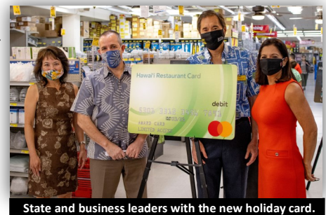
State and business leaders with the new holiday card.

More Hawai‘i residents will be enjoying the success of the Hawai‘i Restaurant Card (HRC), including unemployed PUA recipients and workers whose organizations purchased a new “Business Holiday Card” to give to their employees and others. Businesses can order online through Dec. 10 in denominations from $5 to $1,000, and the card can be used through March 31, 2021. Eligible PUA recipients — more than 32,000 unemployed part-time workers — received prepaid cards late last month with $500 to be used at Hawai‘i restaurants, bakeries and food caterers that accept Debit Mastercards through Dec. 15.