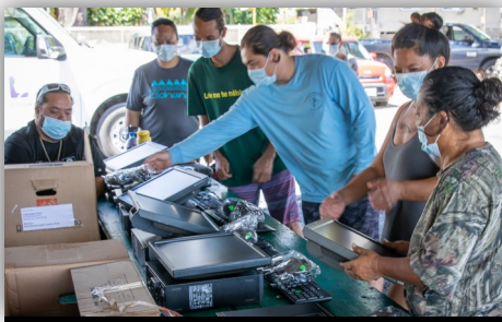
The Kuauli team prepares computers for Hilo distribution.