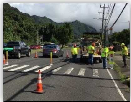
More infrastructure projects will be funded statewide.

Every degree counts to curb global warming.