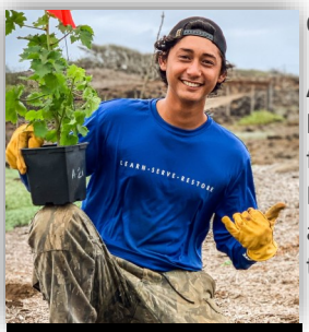
People can apply for 130 openings in a new Kupu 'Āina Corps green jobs' program. For details, go to <u>https://</u> www.kupuhawaii.org/aina/.

A. It signals a return to a more normal emergency situation in which the counties take the lead, and the state provides guidance and support. We've left in place the statewide indoor mask mandate and the Safe Travels program. But now the county mayors can implement appropriate measures for social gatherings, restaurants and other venues, including lifting capacity restrictions. However, we're still encouraging people to get vaccinated and make smart choices about activities to keep everyone safe.